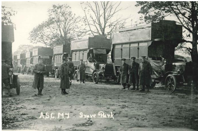
Army Service Corps Mechanical Transport in Grove Park preparing for transport to the Western Front.