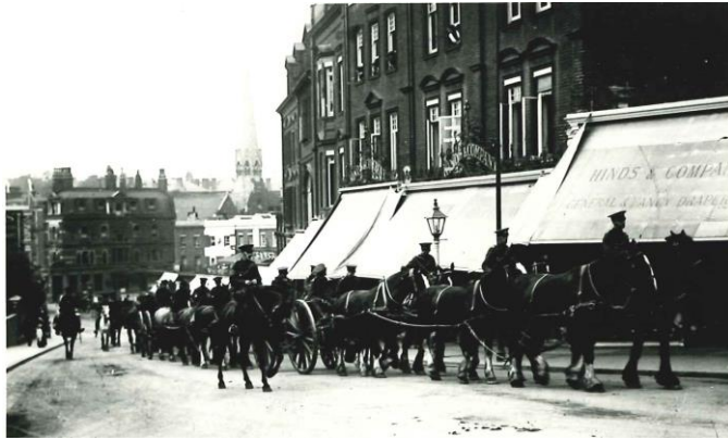
Horse Artillery in Blackheath